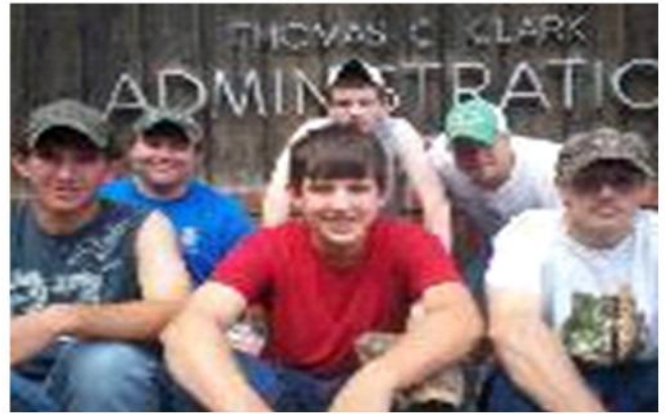
Central High School FFA Summer Camp