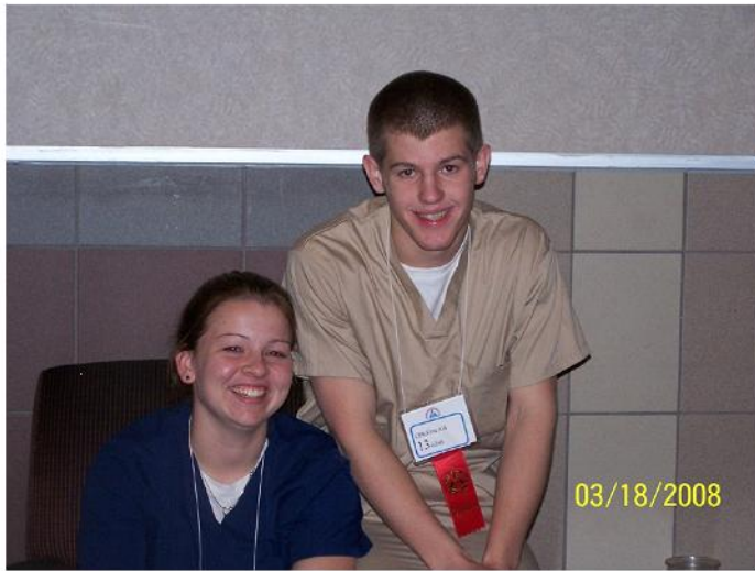
Middleton High School had winners at this year's FFA Leadership Camp this summer.